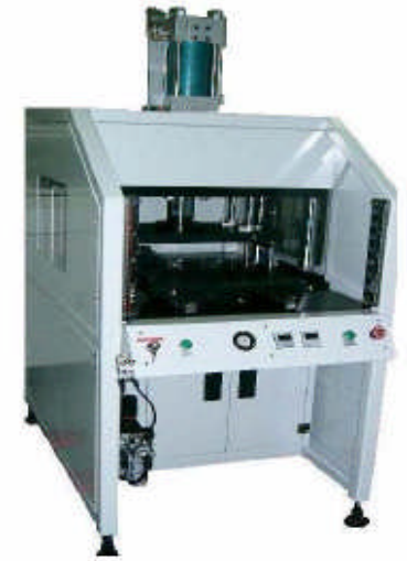
Singulation Press 8 tonnes