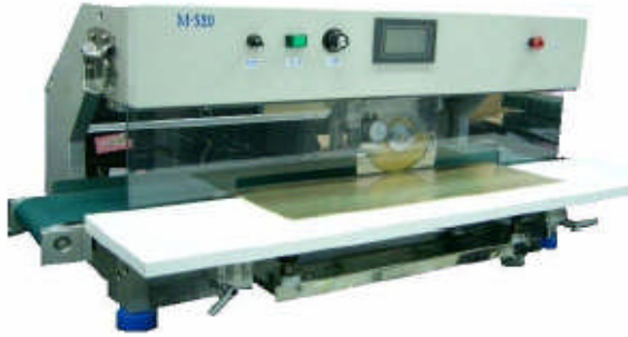
V-Groove Depaneliser Straight Cut with conveyor and safety cover