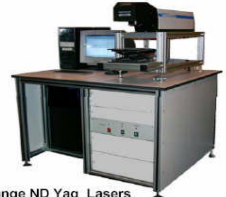
Range ND Yag Lasers