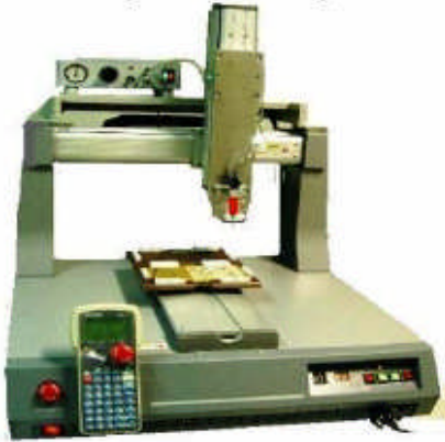
Epoxy or Solder Paste Dispenser