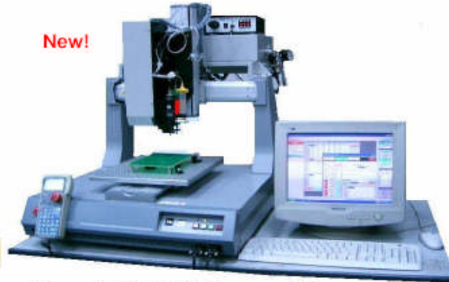
Damp & Fill -COB Encapsulation