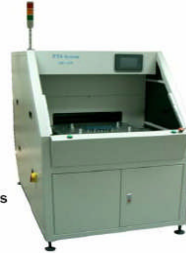
Singulation Press 30 tonnes