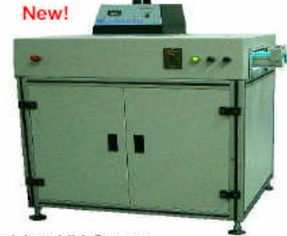
In-Line UV Ovens