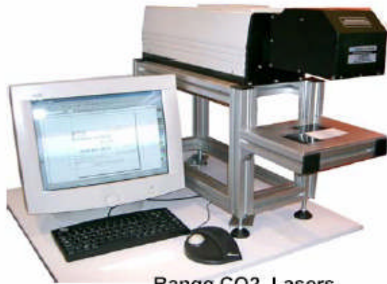
Range CO2 Lasers